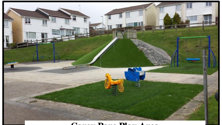
Carey Parc Play Area