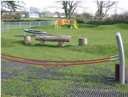
King George V play area