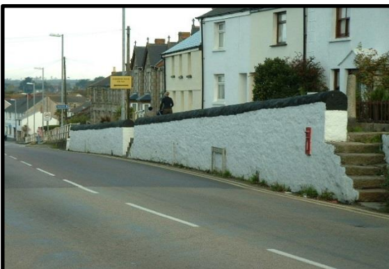
Whitewash walls in Meneage Street

The CCTV system in the town has similarly been taken over by the Town Council, again to secure its future.