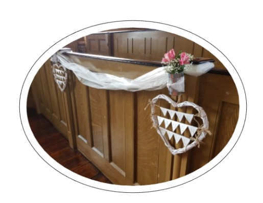
Terms & Conditions