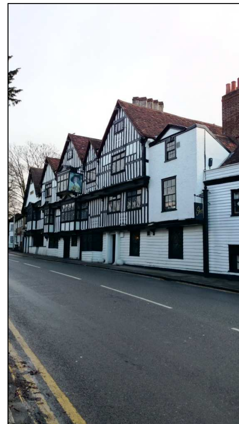
The Old Kings Head