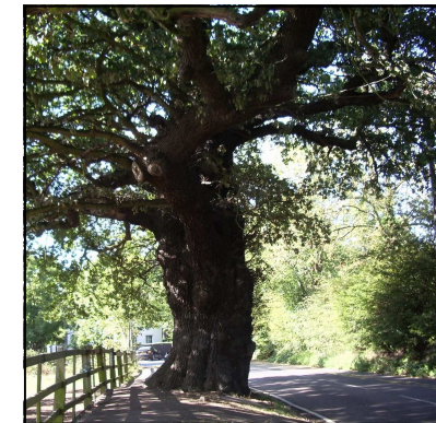
"The Dickens Oak" Vicarage Lane, Chigwell.

The large oak trees are remnants of the hedgerows which used to mark out the old field boundaries. The large fields created by removing hedges make farming more efficient but at the expense of the landscape and wildlife.