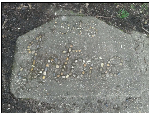
The Intone Stone. This stone can be found just to the side of the track leading to the former barrage balloon sites. "Intone" refers to a Coastal Command operation involving the 220 Squadron and The Mobile Signals Unit from RAF Chigwell. Their task was to undertake anti-submarine duties in the Atlantic.

Today Chigwell still attracts the rich and famous from footballers to Lords.