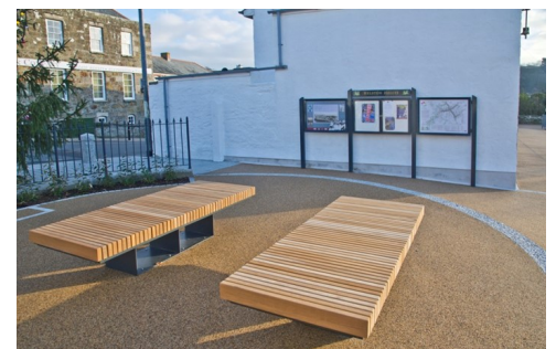
Grylls Monument awarded runner up in the public realm category of the Civic Voice Design Awards 2016