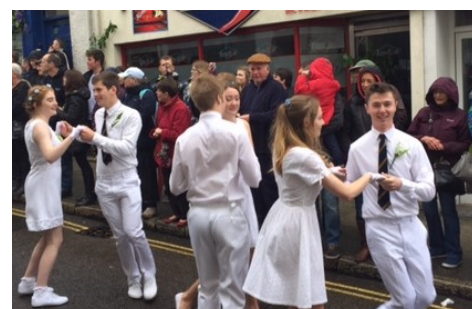
Helston Town Band lead the way for the Children's Dance on Flora Day 2017