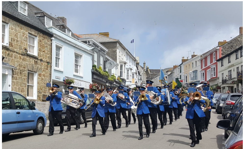
Helston Town Band lead the parade through the town