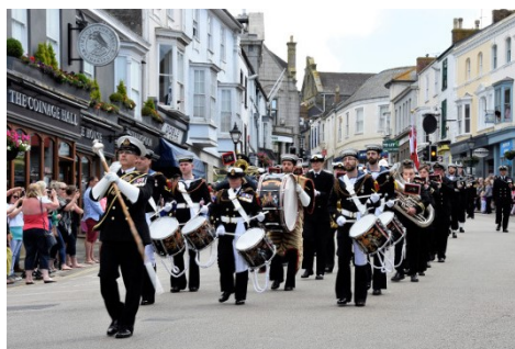
RNAS Culdrose personnel exercise their right to march through Helston Town.