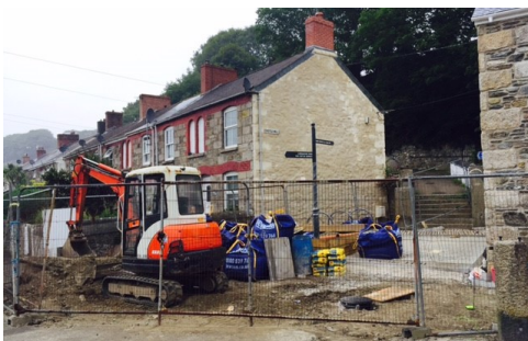
Castle Hill Steps refurbishment

Part of the Public Realm Improvement Scheme works are currently underway on the Castle Hill Steps. Works are expected to be completed by August. The aim of this project is to encourage and increase footfall in to Helston Town Centre.