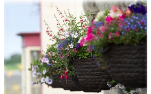
Helston Hanging Baskets